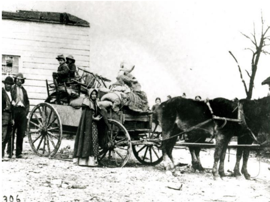
USA, Civil War, refugee family, photo. / Credit: akg Images / Universal Images Group / Copyright © AKG Images / For Education Use Only. This and millions of other educational images are available through Britannica Image Quest. For a free trial, please visit www.britannica.co.uk/trial

A family leaving their home in the South as the fighting approaches