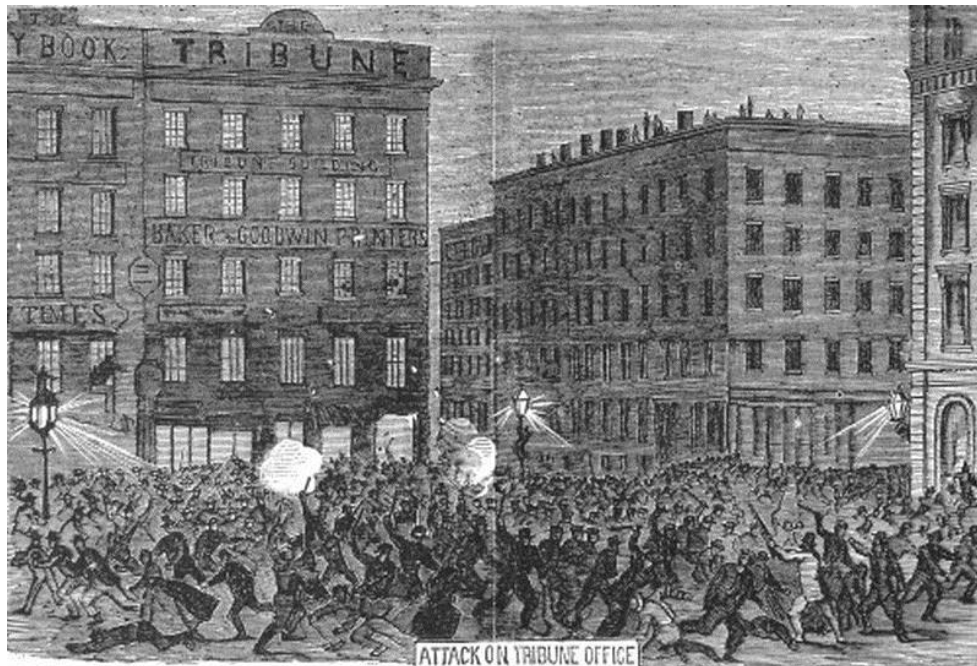
NEW YORK: DRAFT RIOTS, 1863. - A mob of rioters attacking the offices of the 'New York Tribune' during the New York City Draft Riots of 13-16 July 1863. Contemporary American wood engraving. / For Education Use Only. This and millions of other educational images are available through Britannica Image Quest. For a free trial, please visit www.britannica.co.uk/trial

Anti draft riots in New York in 1863 after Congress passed a new conscription law.