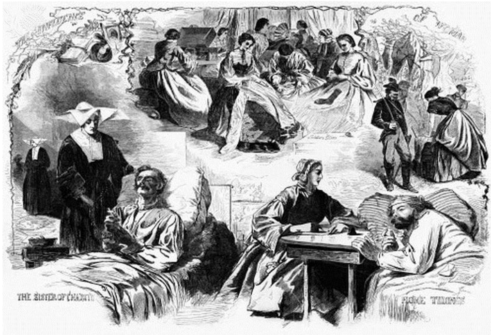
CIVIL WAR: WOMEN, 1862. - 'The Influence of Woman.' Composite of scenes of women sewing and doing laundry for soldiers, a nun visiting a wounded soldier and a woman writing a letter, during the American Civil War. Wood engraving, 1862 / Credit: The Granger Collection / Universal Images Group / Copyright © The Granger Collection / For Education Use Only. This and millions of other educational images are available through Britannica Image Quest. For a free trial, please visit www.britannica.co.uk/trial

1862 woodcut entitled ‘The Influence of Women’